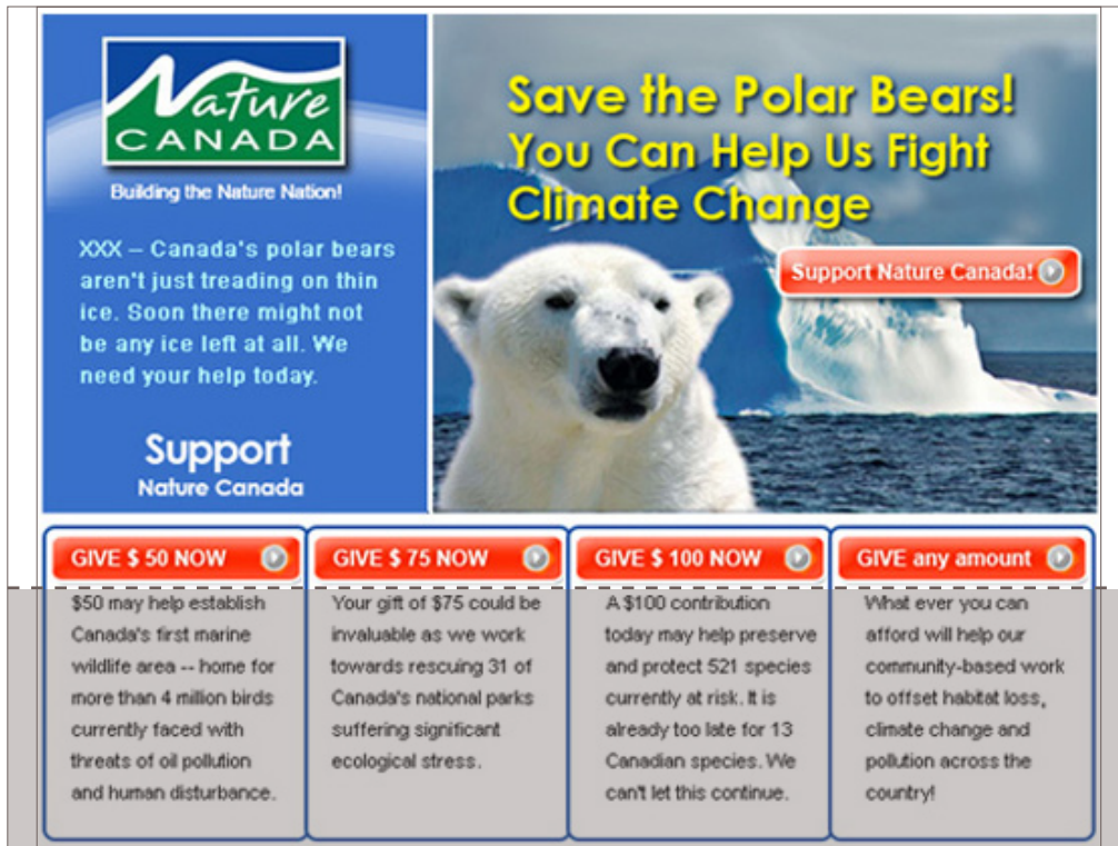
The highlighted area represents the top 25% of your message that viewers can see within a preview pane. Include the most compelling elements of your message in this top portion of your email.

tactic has the added benefit of allowing you to track the links that are most frequently clicked, which will help you evaluate supporters' interests and the impact of your message. But instead of simply dumping them onto your homepage, send readers directly to a page where they can take action, such as signing up as an advocate, making a donation or registering for an event.