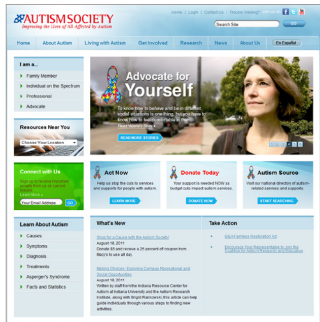
Convio CMS makes it easy to manage an enterprise site.

Convio CMS keeps tabs on your content with reports on publication dates, broken links, and workflow progress.