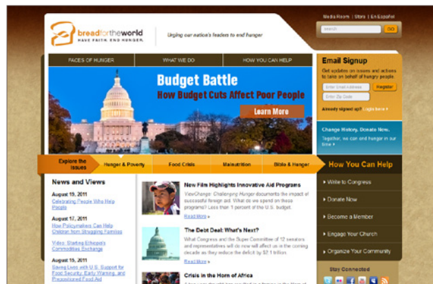
Polished templates ensure consistency throughout the site.

Enforce corporate styles and branding based on your business rules. Create your own style sheets to control presentation using CSS.