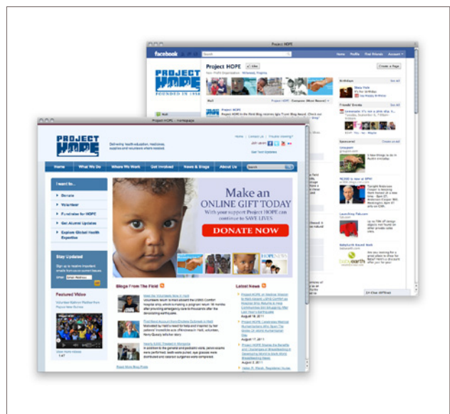
Convio CMS supports advanced integration with social media.

Integrate your website with other applications by sharing sessions using an application program interface (API). Manage constituent data and groups or enable single-sign on to 3rd party web services.